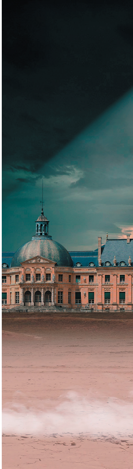
illustration : Hélène Builly / Costume3pièces

Find all the news about the Circul'Art 2 project on the Film Paris Region website contact@filmparisregion.com